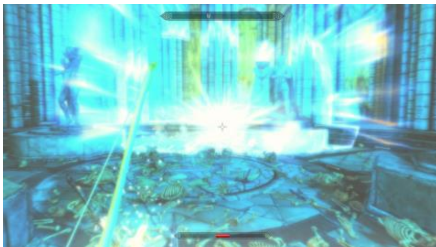
Auriel's Radiance effect (Meridia's Redemption) – Vampires players must be very careful